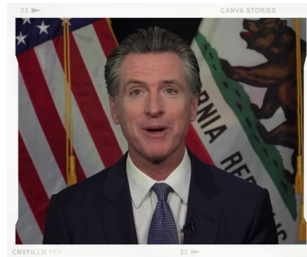
Governor Newsom Recognizes CBPA