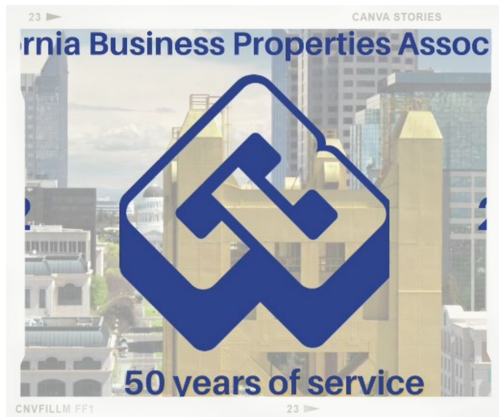
50 Years of Service